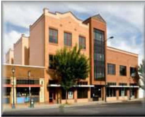
MARTIN LUTHER KING JR. BLVD